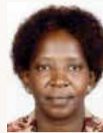
Hon. Linah Jebii Kilimo EGH