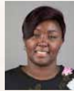
Hon. Charity Chepkwony MP, EGH