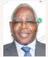
Hon. Justice (Rtd.) Aaron Ringera