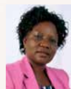
Hon. Rachel Ameso