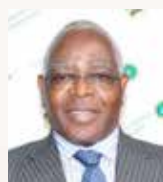
Hon. Justice (Rtd.) Aaron Ringera